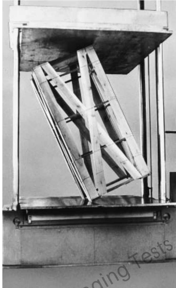
FIG. 1 Compression Applied Diagonally Opposite Edges